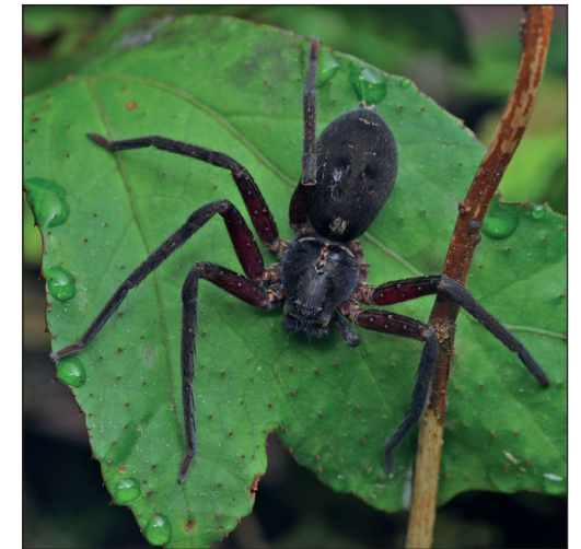
Sinopoda xishui Zhang, Yu & Zhong, sp. nov.