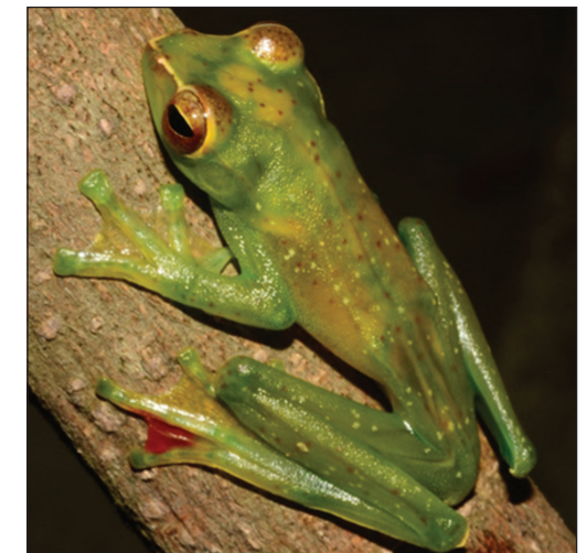
Zhangixalus tunkui Kiew, 1987