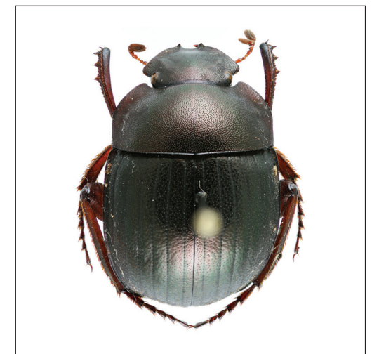
Gyronotus perissinottoi Moretto, sp. n.