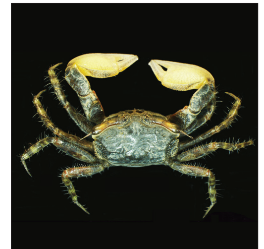
Tmethypocoelis celebensis Murniati et al., sp. nov.