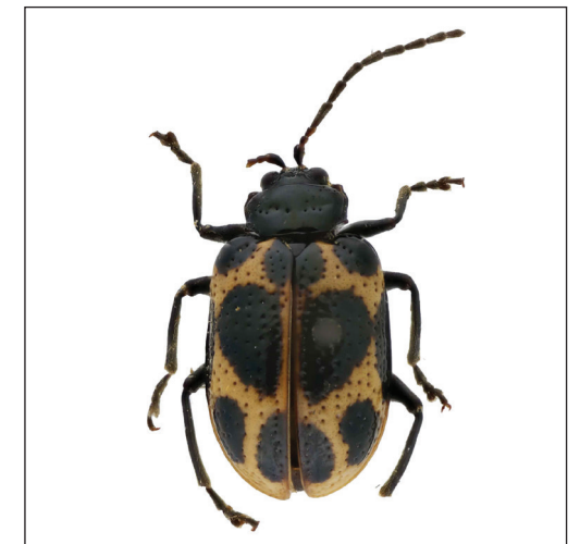
Aplosonyx nigricornis Feng et al., sp. nov.