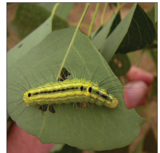
Larva of Gadirtha fusca Pogue, sp. n.