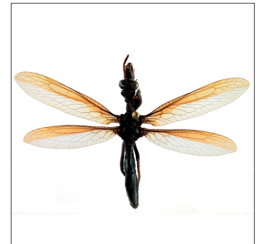
Climaciella elektroptera Ardila-Camacho et al., sp. nov.