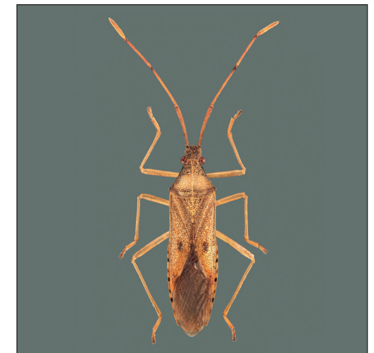
Manocoreus hsiao Zhou et al., sp. nov.