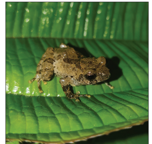
Raorchestes malipoensis Junkai Huang et al., sp. nov.