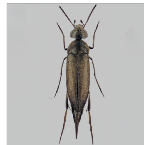
Mordellistena platypoda Selnekovič, Goffová & Kodada, sp. nov.