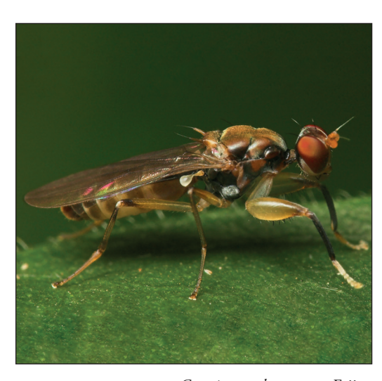
Centrioncus decoronotus Feijen