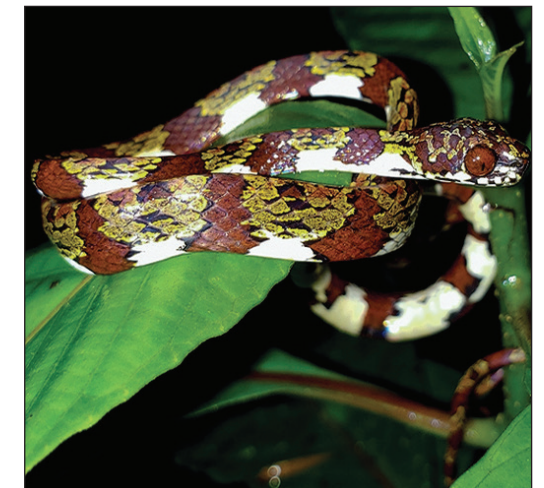
Sibon canopy Arteaga & Batista, sp.nov.