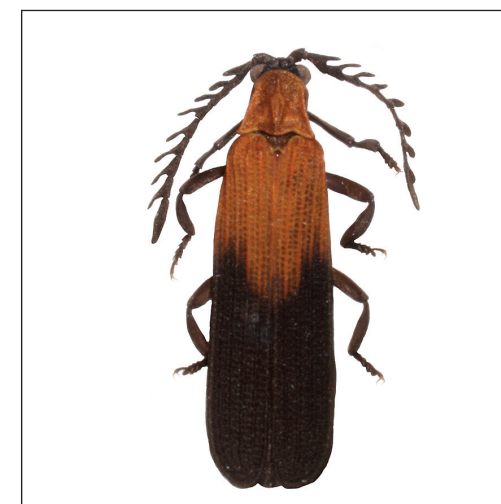
Cautires walteri Bocak, sp. n.