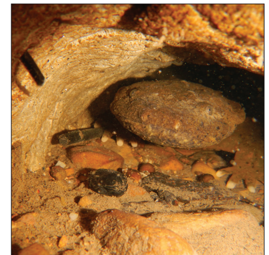
An eastern hellbender ( Cryptobranchus alleganiensis ) which serves as host for a new species of leech ( Placobdella appalachiensis sp. n.).