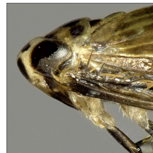
Bambusananus cuihuashanensis Yang & Chen, sp. n.