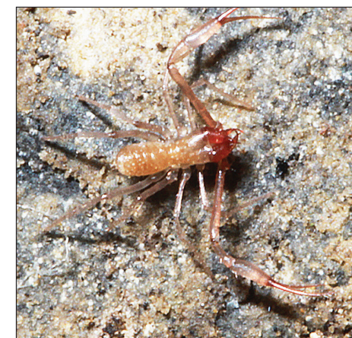
Spelaeochthonius wulibeiensis Zhizhong Gao et al., sp. nov.