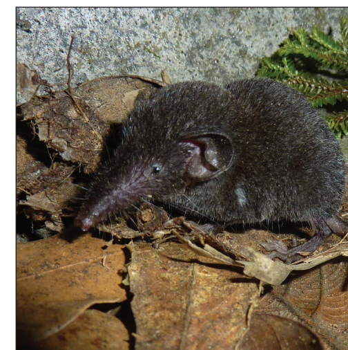
Crocidura sapaensis sp. n.

ZooKeys Launched to accelerate biodiversity research