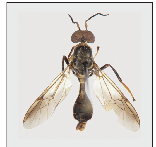
Parastratiophecomyia rozkosnyi Woodley, sp. n.

ZooKeys Launched to accelerate biodiversity research