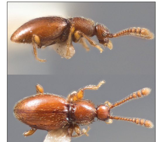
Euconnus falcatus M.S. Caterino, sp. nov.