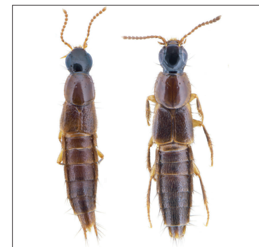
Quediellus debilis (Horn, 1878), comb. res.