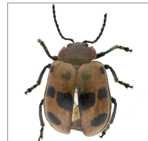
Sphenoraia (Sphenoraia) decemmaculata Chuan Feng et al., sp. nov.