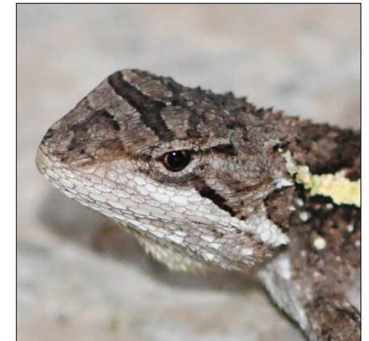
Diploderma limingense Shuo Liu et al., sp. nov.