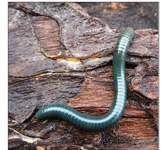
Coxobolellus saratani Pimvichai et al., sp. nov.