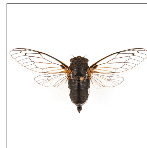
Tibicen neomexicensis Stucky, sp. n.

ZooKeys Launched to accelerate biodiversity research