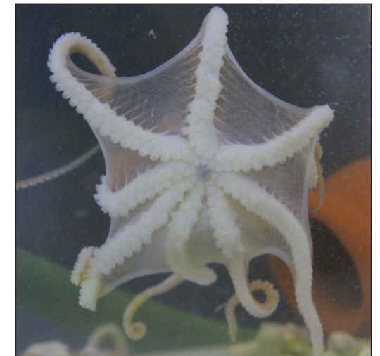
Callistoctopus xiaohongxu Zheng et al., sp. nov.