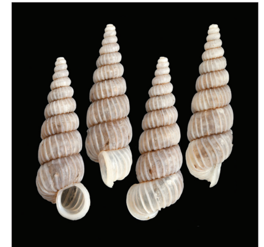
Pseudomatias pallgergeyi Jirapatrasilp, sp. nov.