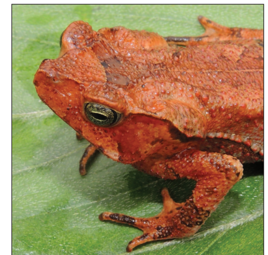
Rhinella yunga Moravec et al., sp. n.

ZooKeys Launched to accelerate biodiversity research