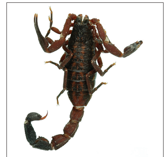
Tityus (Atrius) crassicauda Lourenço & Ythier, sp. n.