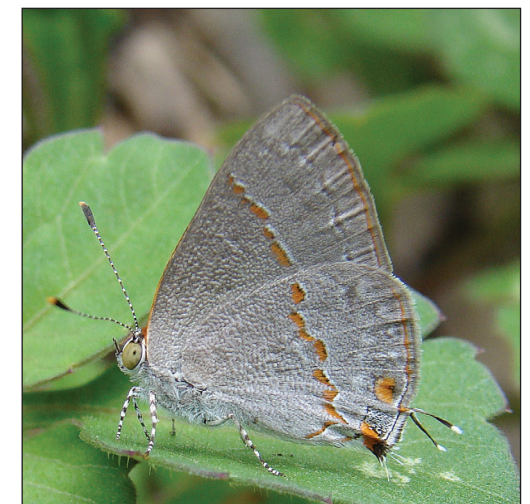
Ministrymon janevicroy Glassberg, sp. n.