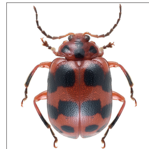
Gallerucida octodecimpunctata Xu & Yang, sp. nov.