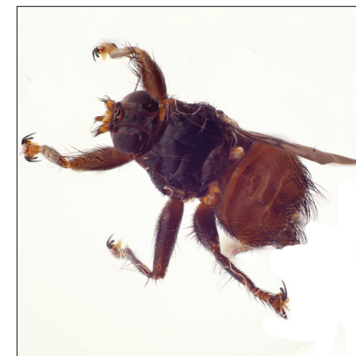
Ornithomya comosa (Austen, 1930)