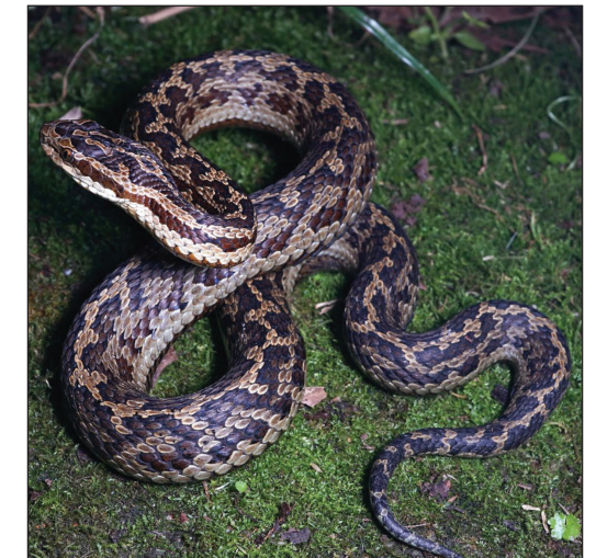
Gloydus lateralis Zhang, Shi, Jiang & Shi, sp. nov.