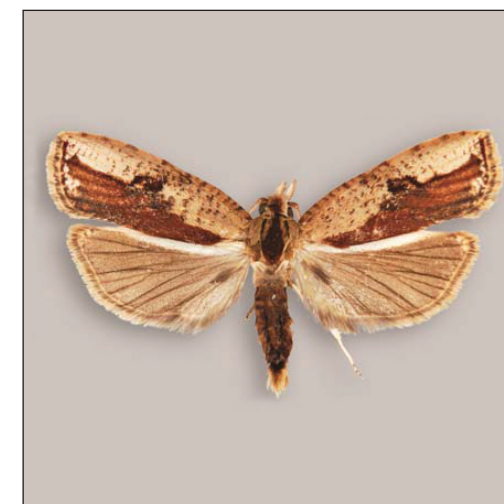
Sparganocosma docsturnerorum Brown, sp. n.

ZooKeys Launched to accelerate biodiversity research