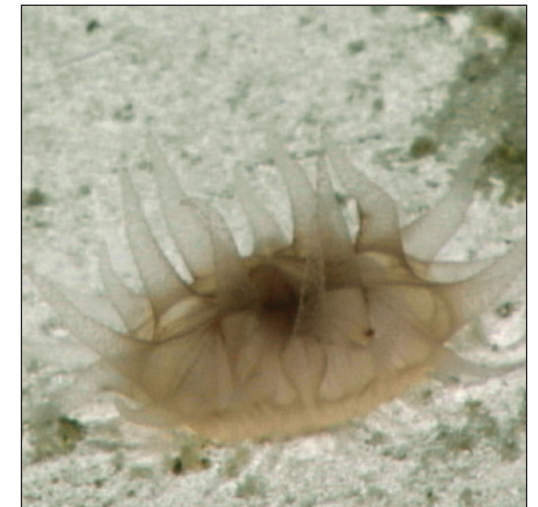
Fungiacyathus ( Fungiacyathus ) cf. fragilis Sars, 1872