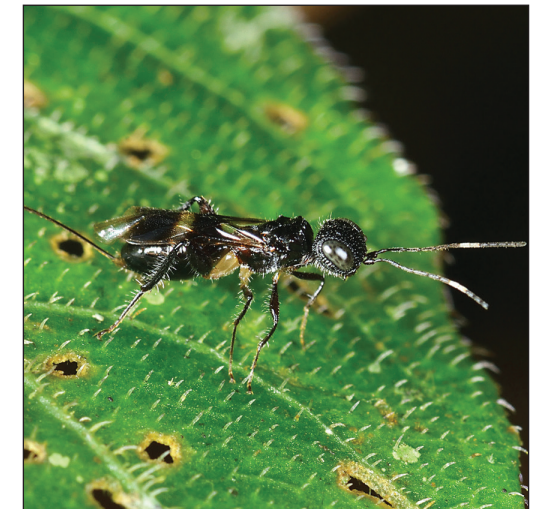
Dinapsis albicoxa Hedqvist 1967