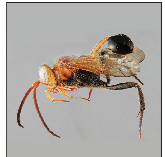
Evaniscus lansdownei Mullins, sp. n.

ZooKeys Launched to accelerate biodiversity research