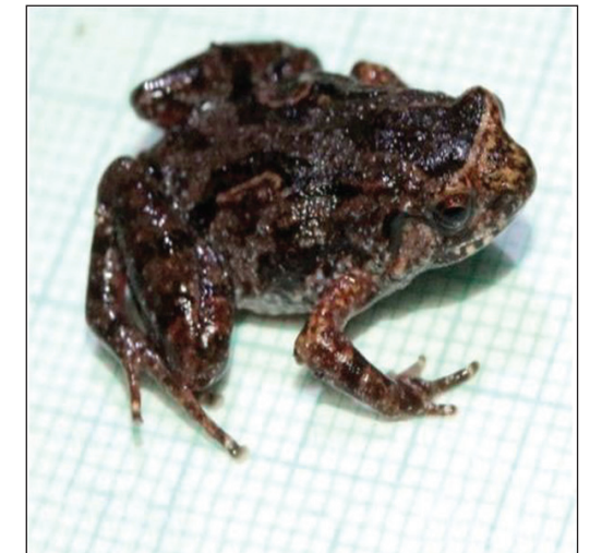
Stumpffia lynnae Mullin et al., sp. nov.