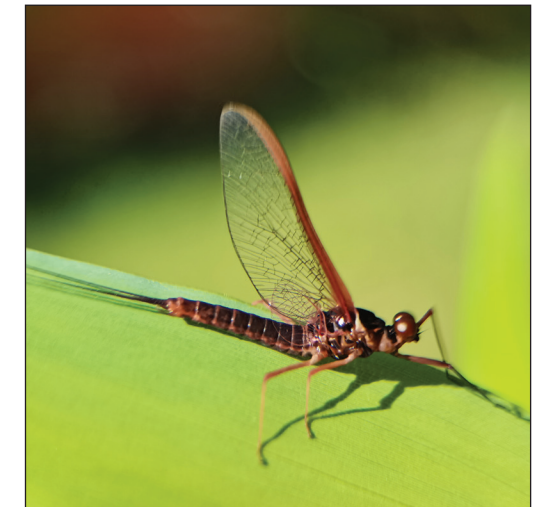
Notacanthella jimwu Li & Jacobus, sp. nov.