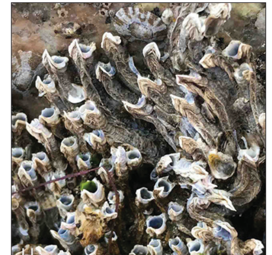
Spirobranchus akitsushima Nishi et al., sp. nov.