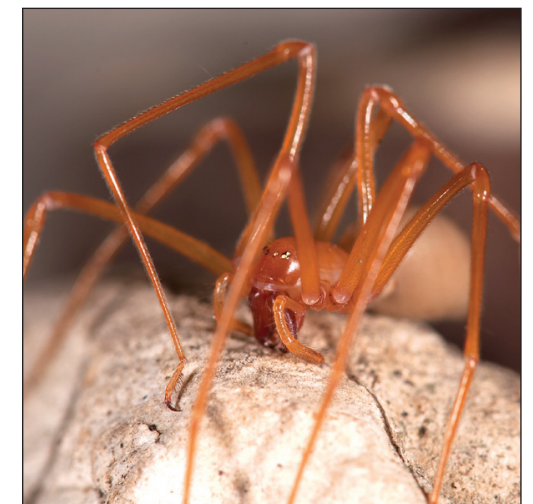
Troglonaptor marchingtoni Griswold, Audisio & Ledford, sp. n.

ZooKeys Launched to accelerate biodiversity research