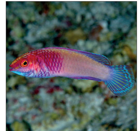
Cirrhilabrus finifenmaa Yi-Kai Tea et al., sp. nov.