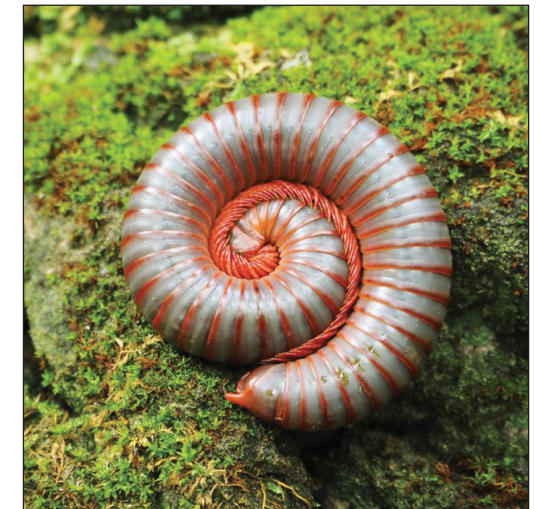
Macrurobolus macrurus (Pocock, 1893), comb. nov.