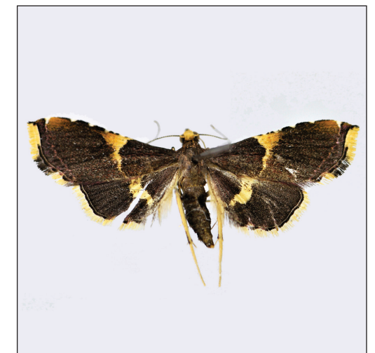
Endotricha shafferi Li, sp. n.

ZooKeys Launched to accelerate biodiversity research