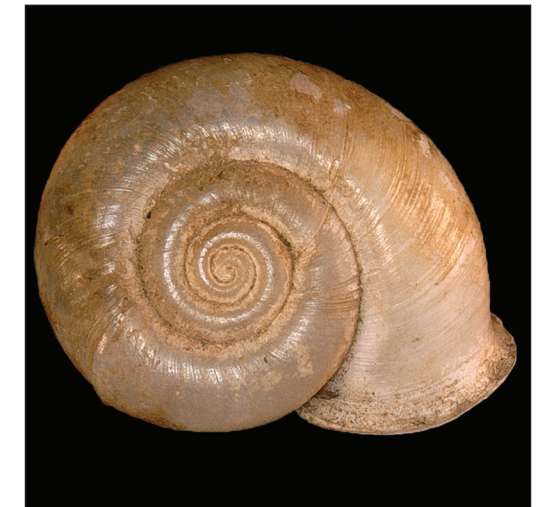
Bouchetcamena procumbens (Gould, 1844), comb. nov.