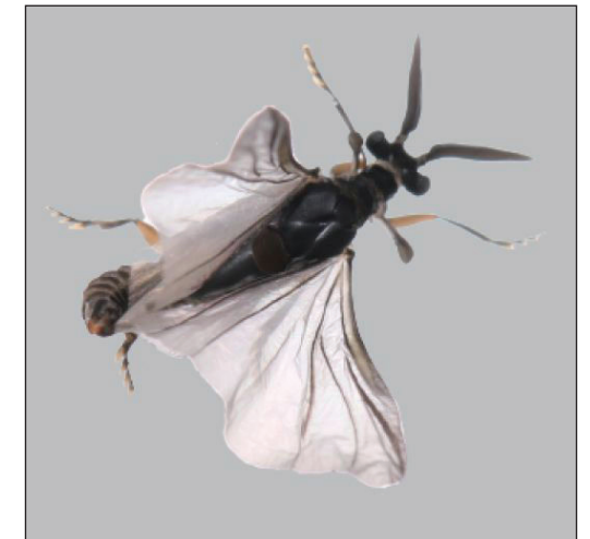
Xenos yangi Dong, Liu & Li sp. nov.