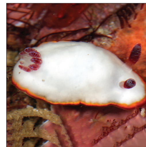
Goniobranchus albonares (Rudman, 1990)