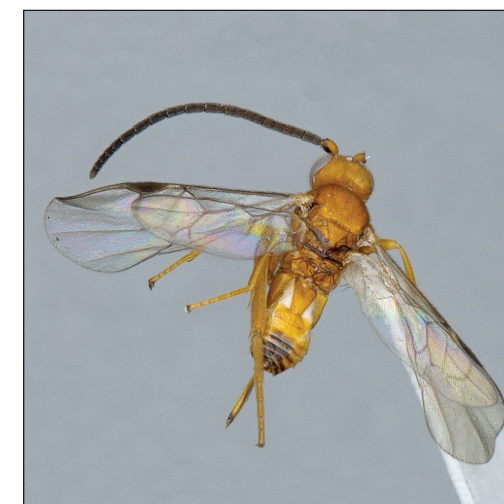
Mariapanteles felipei Whitfield, sp. n.