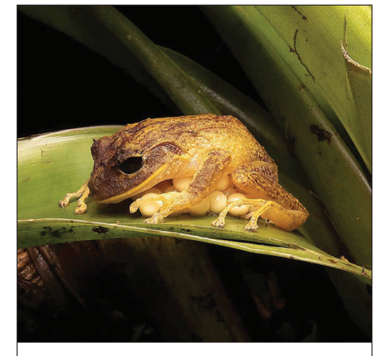
Pristimantis gretathunbergae sp. nov.