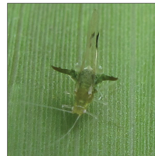
Chucallis latusigladus Qiao, Jiang & Chen, sp. n.