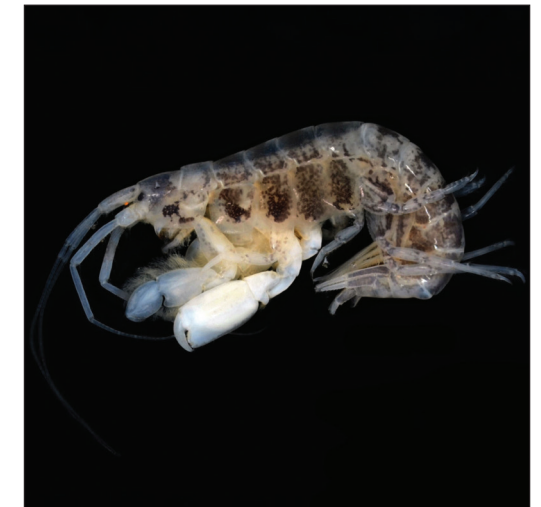
Ampithoe changbaensis Shin & Coleman sp. nov.